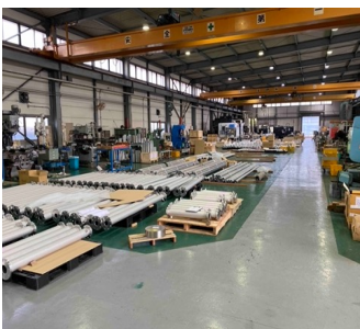
our head office factory (inside)