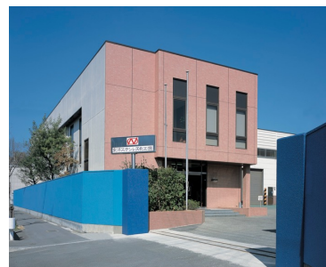
our head office/factory