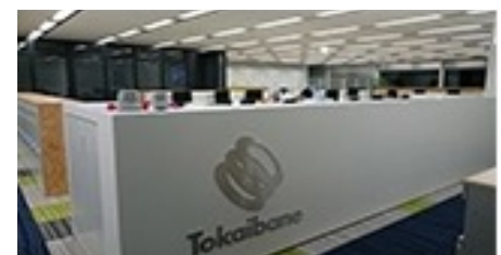
our head office