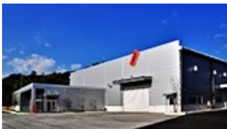
full view of our factory