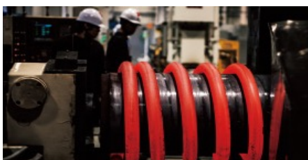
winding up coiled hot-formed compression spring