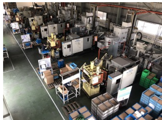
die casting department