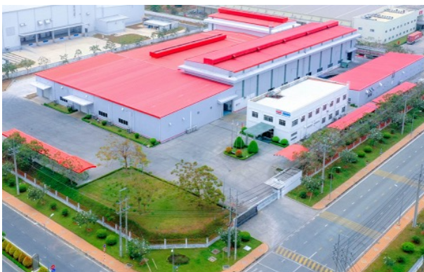
full view of our factory