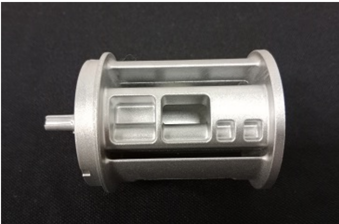
seat belt parts