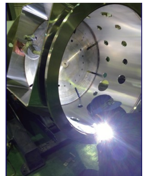
Welding process in manufacturing chambers