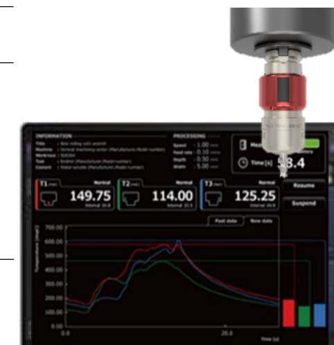
Machining monitoring device MULTI INTELLIGENCE® J

metal materials (carbon steel, alloy steel, etc.) (Japanese and Vietnamese) (2) Manufacturers and distributors of holders for cutting tools (drill, end mill, reamer, etc.) (Japanese and Vietnamese)