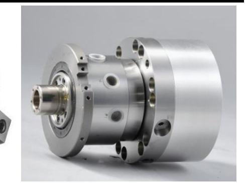
4. KAMIYA SAW&KNIFE MFG. CO., LTD. METALEX VTN